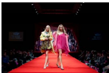
Models at Clothes Show Live 2010

Live makeovers, live shopping, live celebrities, live catwalk shows for the ultimate girls' day out – Clothes Show Live in association with Suzuki is back. This year will be its biggest and most interactive show to date and promises to Keep Fashion Live .