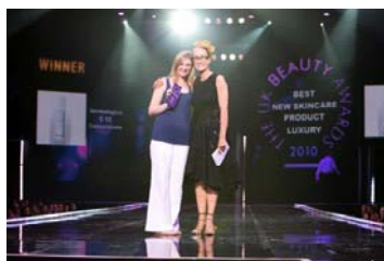
UK Beauty Award Winner 2010