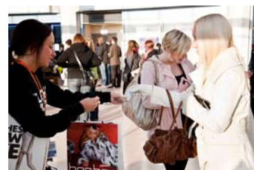
Shoppers at Clothes Show Live 2010

This year's shortlisted products are as follows: