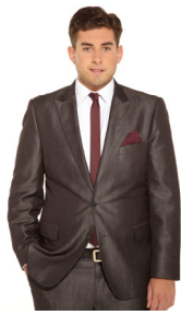
James 'Arg' Argent